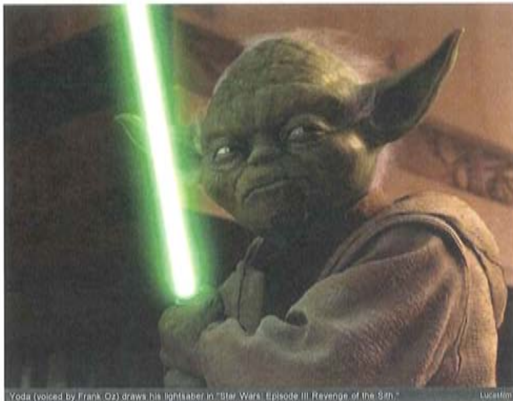
Yoda (voiced by Frank Oz) draws his lightsaber in "Star Wars: Episode III: Revenge of the Sith."

Comments | Twitter | Facebook | LinkedIn | Digg | Reddit | Buzz | Email