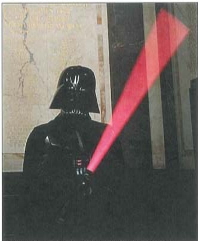
Film weapon ... Star Wars villain Darth Vader with lightsaber

"But because these lasers are manufactured abroad, there is nothing we can do to stop their sale over the internet."