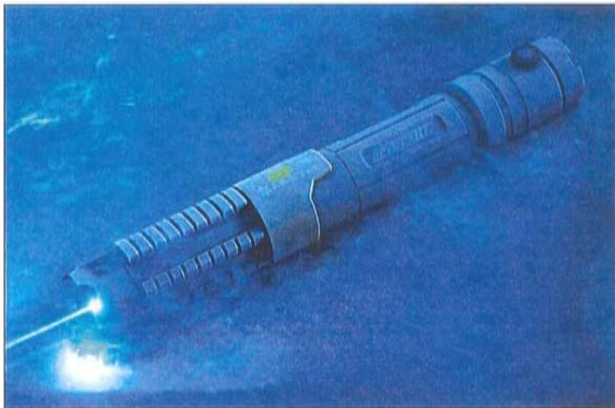
Enlarge Bright idea ... dangerous laser